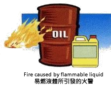
Fire caused by flammable liquid 易燃液體所引發的火警