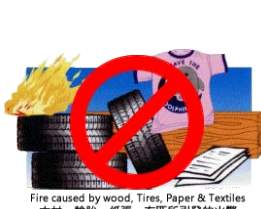
Fire caused by wood, Tires, Paper & Textiles 木材、輪胎、紙張、布匹所引發的火警

消防處批准售賣 Hong Kong Fire Service Department's Ref: FP 206/1152