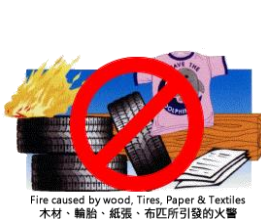
Fire caused by wood, Tires, Paper & Textiles 木材、輪胎、紙張、布匹所引發的火警