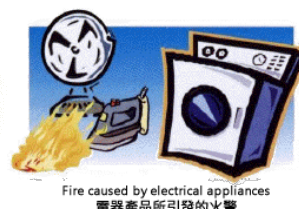
Fire caused by electrical appliances 電器產品所引發的火警