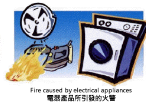
Fire caused by electrical appliances 電器產品所引發的火警